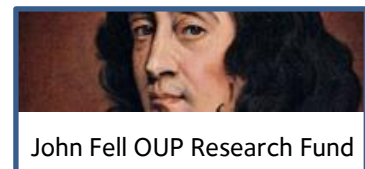
John Fell OUP Research Fund

Funding to support: (a) pump priming, (b) early career researcher, (c) other academic activities likely to lead to new research initiatives, (d) Research Facilitators, (e) support related to bids for external funding, (f) strategic investment in research assets.