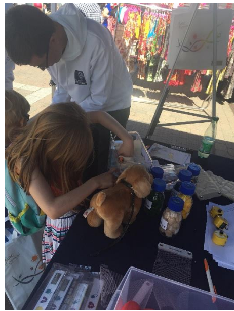
Young visitors exploring the causes of allergy and eczema at the MRC Festival of Medical Research.